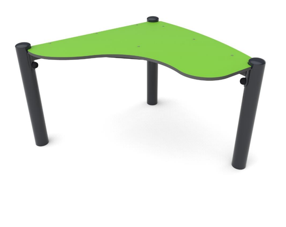
Table Series Quick Sand RPS-SK